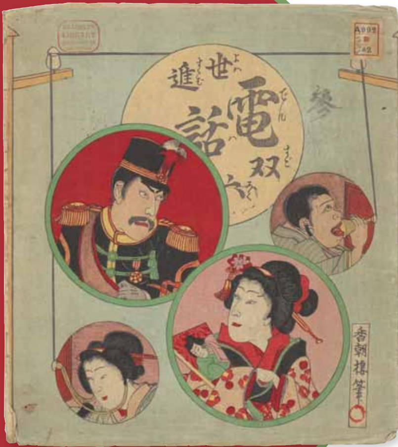
Double Sixes: The Telephone in the Changing World This wrapper touts artwork by Kōchōrō (Kunisada III); the game board it protected, however, names no artist. Publishers were known on occasion to commission a different, more celebrated artist to design the outer wrapper in order to spur sales.

possibly paired with instructions printed on the board itself.